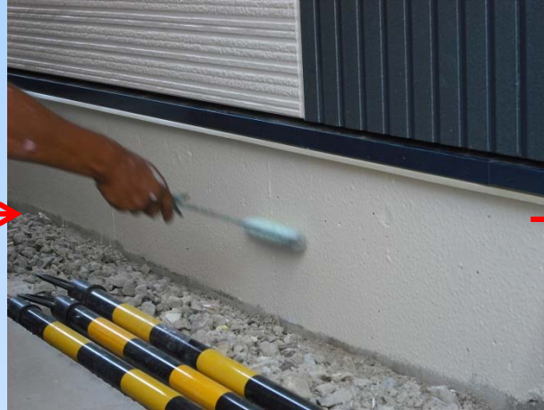
Painting adhesive material