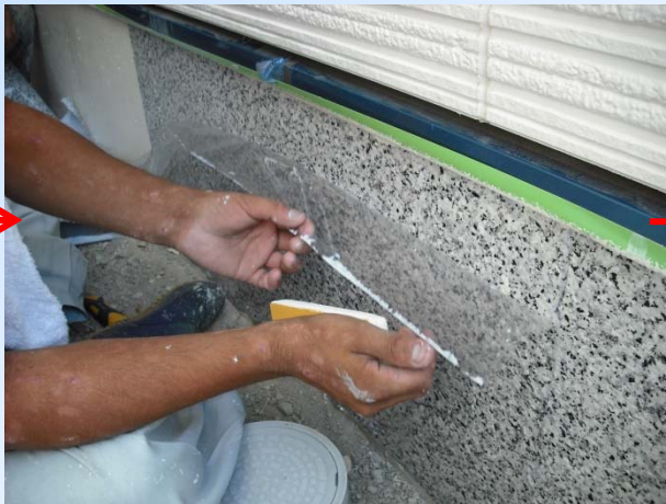
Removal of cover films (PP)