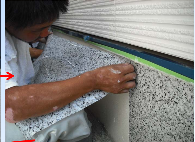
Sticking Tracing films on the wall